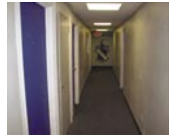
The finished product!

Ohio Zeta continues to strive in ways to better the house and the men who call 1942 luka home. ■